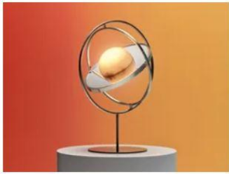
The IKEA SAMMANLÄNKAD table lamp has been designed with Little Sun.

range. The table and ceiling lamps come with a detachable half-sphere light source, which can be recharged via integrated solar panels or USB. The USB ports can also charge small gadgets on the go. Little Sun is a nonprofit organization which produces affordable alternative energy solutions. Two LED lamps are available in the lineup, originally launched in 2019, aiming to increase awareness of the need for clean energy options. The light source is powered by solar panels and rechargeable batteries, with the option to charge the gadget via USB-A and USB-C ports on a cloudier day. IKEA and Little Sun collaborate on new SAMMANLÄNKAD solar LED lamps - LEDinside