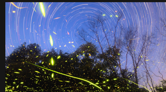
Creatures of the Night (flora & fauna)