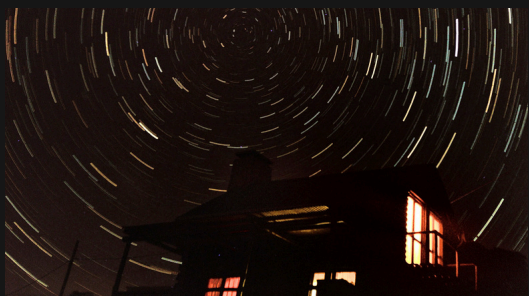
Mobile Nighttime Photography