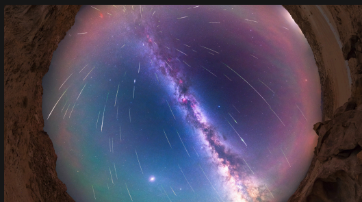
Capture the Dark