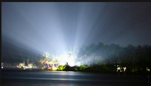
The Impact of Light Pollution