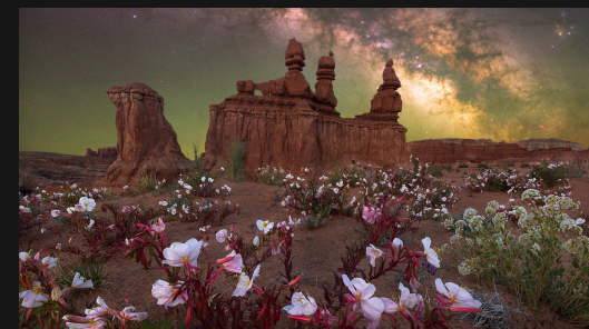
International Dark Sky Places