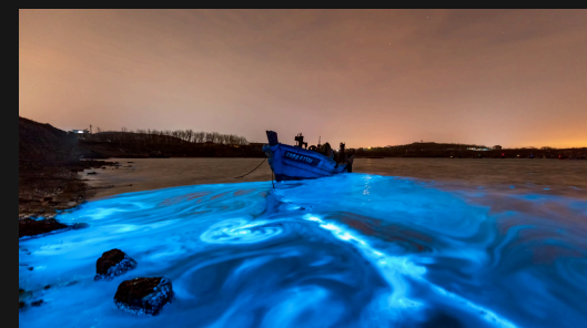
Peoples Choice Award