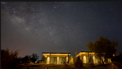
Dark Sky Friendly Lighting and Design